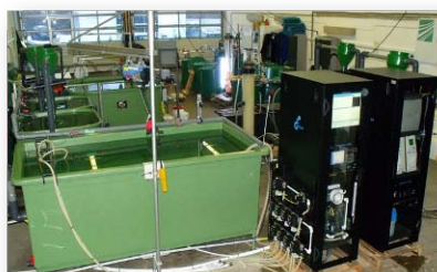
OceanPack Aquaculture IMTA system water quality monitoring for 20 tanks with water supply control, e.g. CO 2 , nutrients, oxygen; incl. auto-cleaning