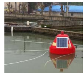
Buoy analyzing system consists of CO 2 sensor MK5 and SmartDI® data logger